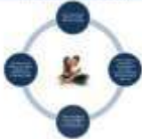
The Foster Care Team